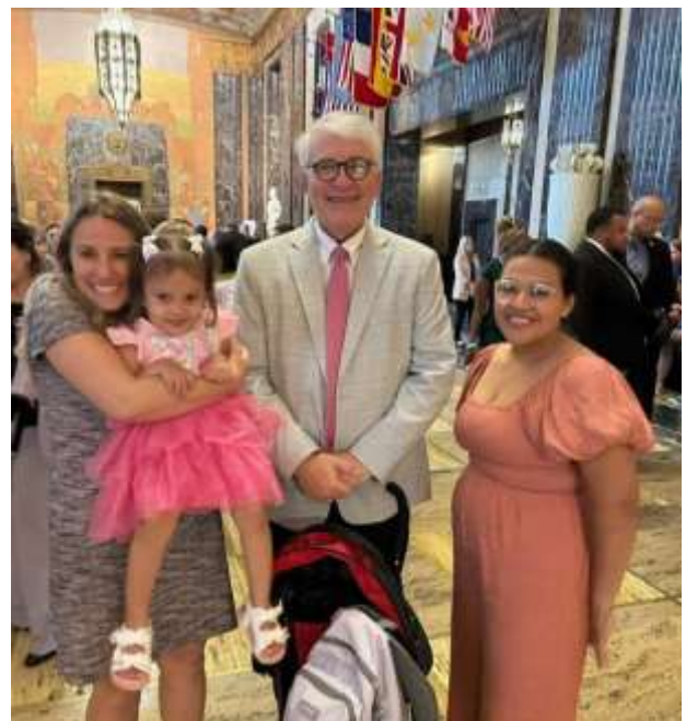
Family blessed by Samaritan's Purse