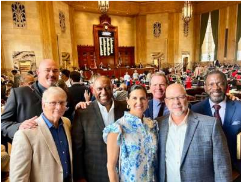
Pastor's Meeting at the Capitol